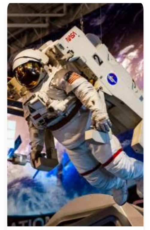
Space Center Houston