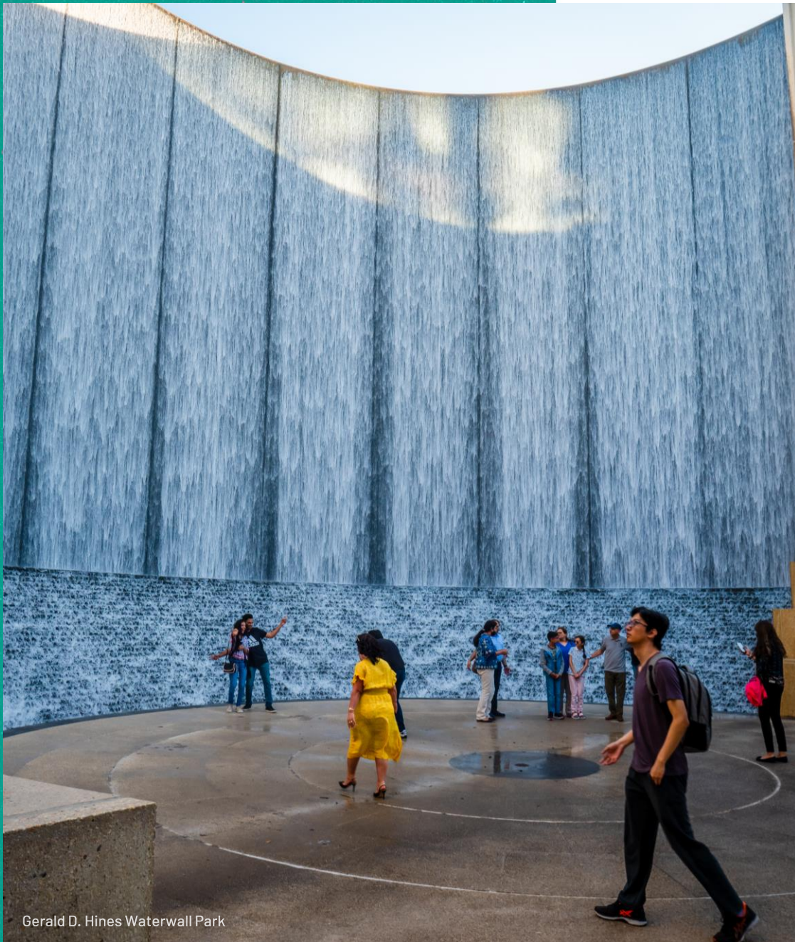
Gerald D. Hines Waterwall Park