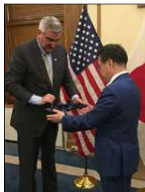
Indiana Governor Eric Holcomb greets Minister Hiroshige Seko, when Seko visited Indianapolis.

I've played basketball in Indiana's Sister State, Tochigi Prefecture with Tochigi Governor Tomikazu Fukuda and at Toyota Headquarters in Toyota City and