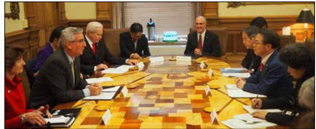
Above, Minister Seko attends a discussion on economic relations in Indiana, with the state's Japan automobile industry representative, along with Indiana Governor Eric Holcomb.

We would like to strengthen our close relationships in trade and investment with the State of Ohio and other states in the Midwest, the center of American manufacturing. To that end, we will continue to strongly encourage and support companies in both countries that are eager to expand their overseas businesses, through the business matching program and investment promotion seminars hosted by JETRO, which has 45 offices across Japan.