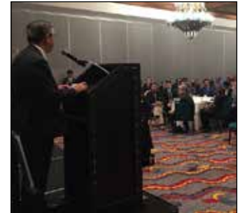
Ambassador Sugiyama addresses the National Governors Association (NGA) summer conference.