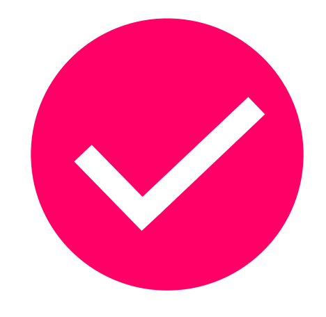
Place your product on the market

Ensure the UKCA marking is placed correctly to comply with product regulations