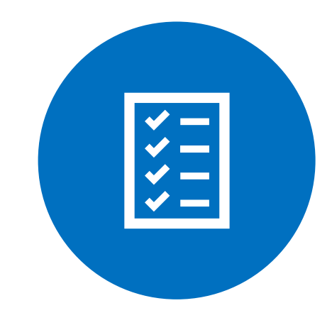
Draw up the appropriate technical documentation

Use an EU or UK conformity assessment body or self-assess and complete documentation