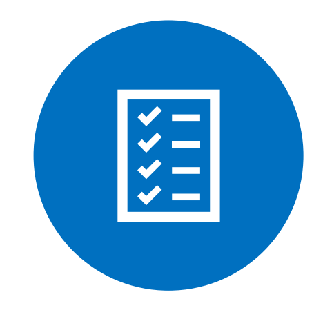
Draw up the appropriate technical documentation

Use a UK conformity assessment body or self-assess and complete documentation