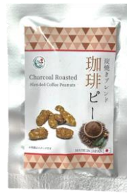
Charcoal Roasted Blended Coffee Peanuts