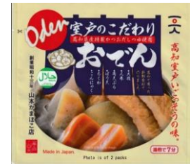
Oden (Japanese Stew/Hot Pot) (Aluminum pouch)