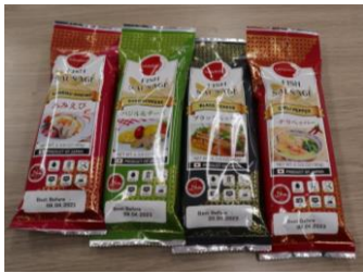
SANRIKU FISH SAUSAGE