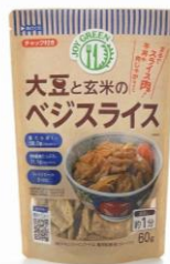
Veggie slice of soy and brown rice