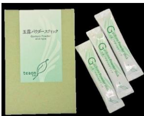
Gyokuro Powder stick