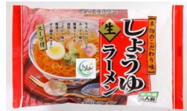
Halal nama ramen with shoyu soup