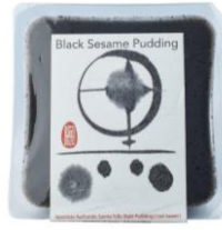
Black sesame tofu