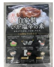
Homemade sashimi squid & liver sauce set