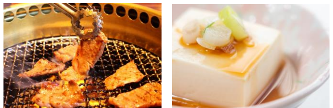
Wanten Yakiniku Sauce Wanten Ponzu Sauce