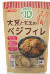
Veggie fillet of soy and brown rice