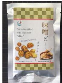
Miso Roasted Peanuts