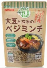
Veggie mince of soy and brown rice