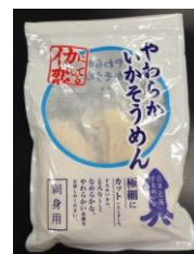
Sashimi Squid Soumen (omelet style) 10 pcs