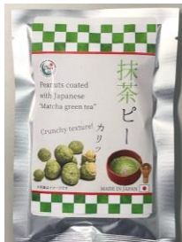
Matcha Roasted Peanuts