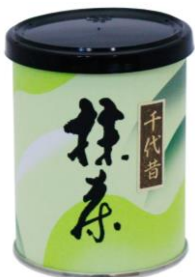
Ceremonial Nishio Matcha