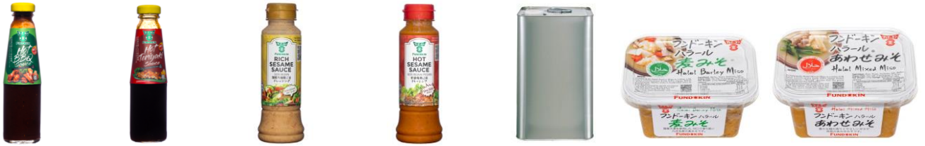
Halal BBQ Sauce Hot Teriyaki Sauce Rich Sesame Sauce Hot Sesame Sauce Soy Sauce Halal Halal Barley Miso Halal Mixed Miso