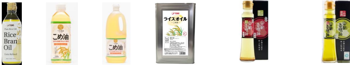
Rice Bran Oil 456g(500ml) Rice Bran Oil 500g Rice Bran Oil 1500g Rice Bran Oil (silicone) Ripe Japanese pepper flavored Rice Bran Oil 97g Japanese pepper flavored Rice Bran Oil 97g