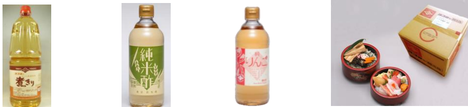
Nikiri ( Like sweet sake ) Junyonesu ( Rice vinegar ) Jun Ringosu YMF-30 ( Sushi vinegar )