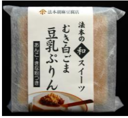
Soy milk Sesame pudding