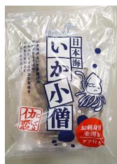
Squid Boy from sea of Japan (Figure) 10pcs