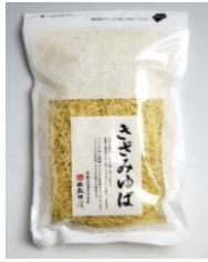
Hiei-yuba Dried Shredded Yuba (soybean curd)