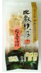
Hiei-yuba Emoji Yuba (soybean curd with Pictograph)