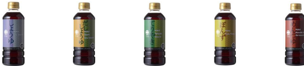
Halal Soysauce Halal Dashi-Soysauce Halal Teriyaki Sauce Halal Yuzu-Citrus Ponzu Halal Noodle Soup