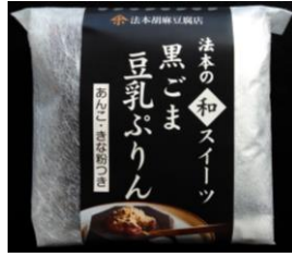
Soy milk Black Sesame pudding