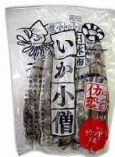
Squid boy from the Sea of Japan (Round) 5pcs