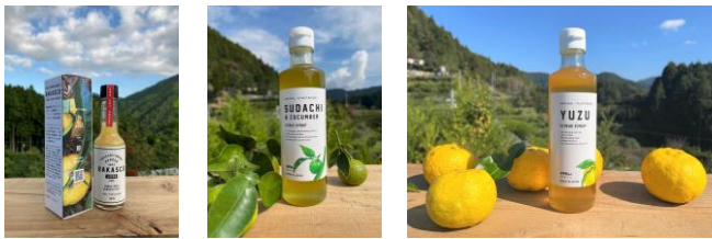
BAKASCO Sudachi & Cucumber syrup Yuzu syrup