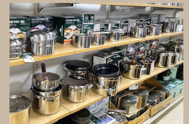
The pots and pans are line up on the entire shelves.