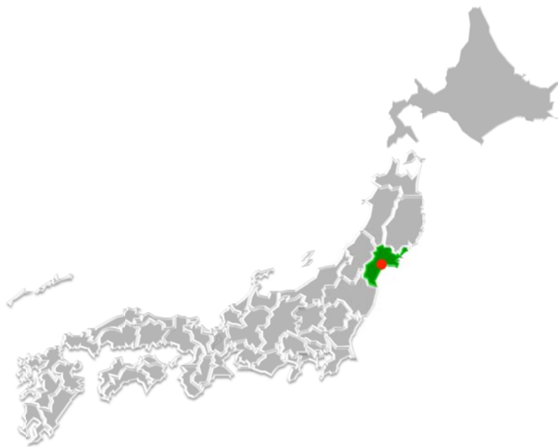
Figure 1: The Location of Sendai

Sendai is the capital of Miyagi Prefecture and the largest city in the Tohoku region, which consists of Akita, Aomori, Fukushima, Iwate, Miyagi, and Yamagata Prefectures. With a population of 1,073,242 (as of October 2014,) Sendai is the eleventh largest of 20 ordinance-designated cities, excluding Tokyo. Sendai has a humid subtropical (Cfa) climate with moderate summers (compared to Tokyo) and cold winters, although to a lesser extent than Hokkaido.