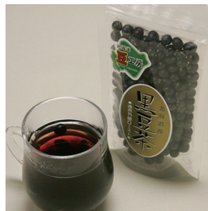
ROAST BLACK SOY BEANS TEA