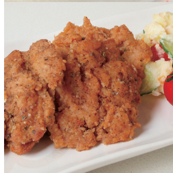
Whole Rice Products