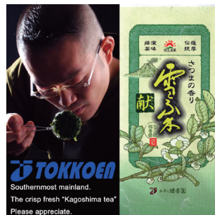
YUKIFUKA (Green tea produced in KAGOSHIMA prefecture)