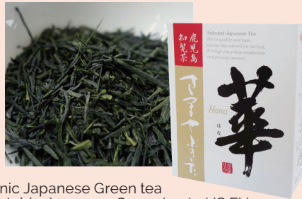
Organic Japanese Green tea Exportable Japanese Green tea to US,EU IPM agriculture Japanese Green tea