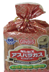
Asparagus-Shaped Black Sesame Biscuit