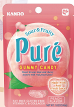
Pure Gummy Candy (Peach Flavor)