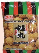
Rice Cracker (Kabukiage, Himemaru)