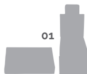
01. HONEY DROPLET with 100% MANUKA UMF 10+