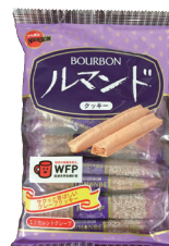
Confectioneries (biscuits, cookies and chocolates)