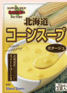
Powdersoup ( corn )