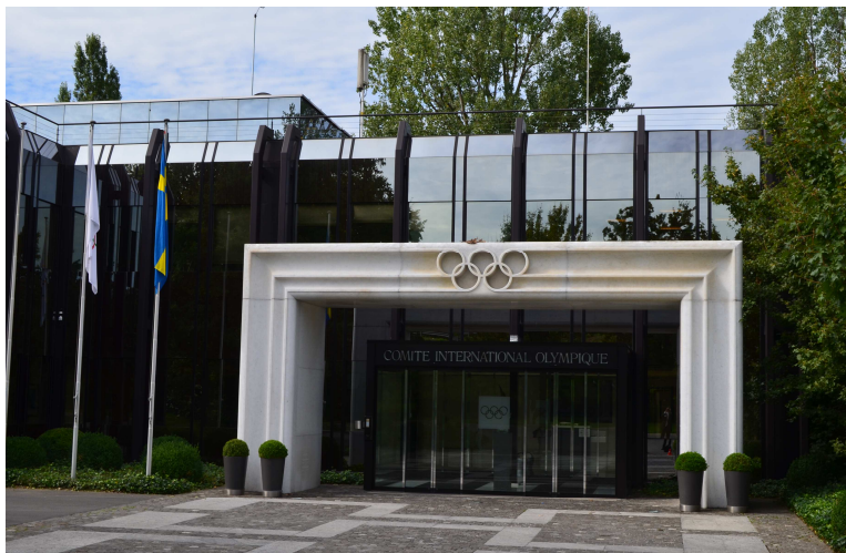
Hiromi Kawamura, International Olympic Committee