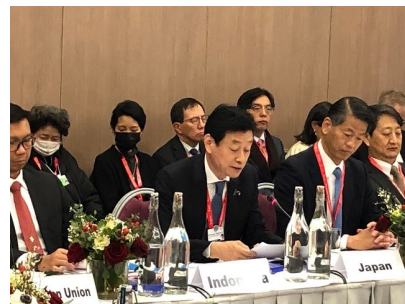
Minister Nishimura at the WTO informal meeting hosted by Switzerland