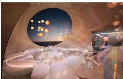
Rooftop bar of the Swiss Pavilion

Switzerland's participation was confirmed by the participation contract signed between the Japan Association for the 2025 World Exposition and the Swiss Confederation. The signing ceremony was held on February 1, 2023 at the official Embassy of Switzer-