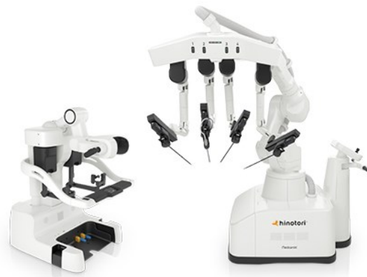
The surgical robot hinotori from Mediaroid Corporation