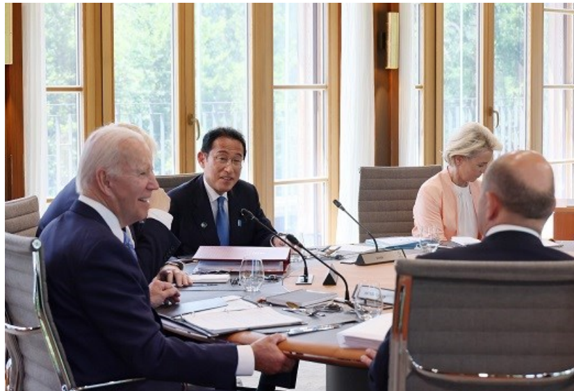
G7 summit in 2022 in Germany attended by PM Kishida