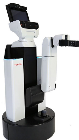
Toyota's Human Support Robot