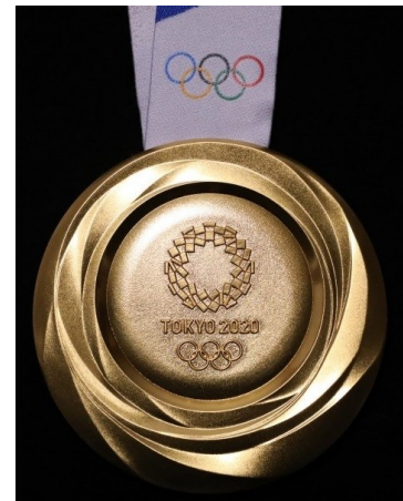
A dream for many athletes

This is also true for the necessary infrastructures such the National Stadium for which local wood has been used to lower its environmental footprint.