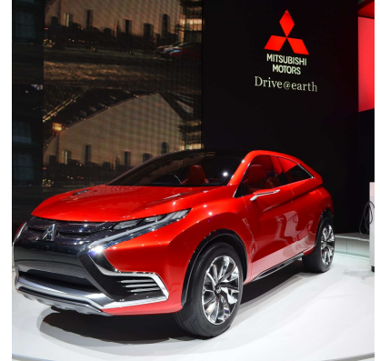
Mitsubishi's XR-PHEV II Concept

EyeSight is a driver-assist system, which prevents or mitigates a possible accident. As shown on the picture, two cameras monitor activity in the road ahead. They provide the following assistances: (1) Adaptive Cruise Control, (2) Pre-collision Braking, (3) Pre-collision Throttle Management and (4) Lane Departure and Sway Warning.