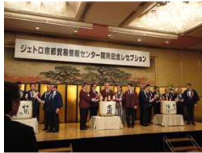
Opening of ceremony