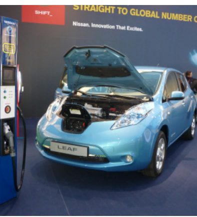
Nissan's Leaf at 2012 Geneva Motor Show

As its power charger is smaller, it provides a trunk of 370 liters, in-