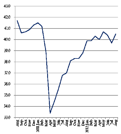
The Development of the Consumer Confidence Index (excluding one-person house-holds, seasonally adjusted series)

The pausing is mainly due to deceleration in Europe and to a lesser extend in Asia. Exports declined 5.8% to ¥5,046 billion in August