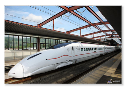
Kyushu Shinkansen

At the time of the story, Kyushu Shinkansen line is extended from Hakata to Kagoshima, cutting travel time to one hour and 19 min-