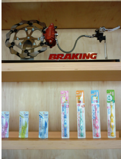
Sunstar's oral care products and bicycle parts

Sunstar developed bike electric equipments