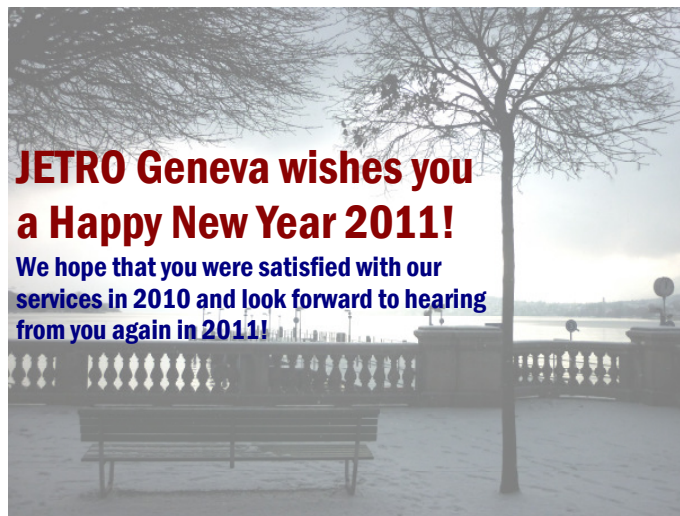
Lake Zurich, December 2010