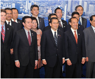
Left: Japan's Minister of Foreign Affairs Seiji Maehara Center: Japan's Minister of Economy, Trade and Industry Akihiro Ohata (Nov. 2010)