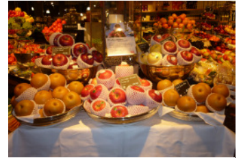
Japanese Aomori apples and Toshihi Nashi pears

However, all fruits cannot be imported. For example, peaches would be too fragile and would suffer from transports. Nevertheless, Globus will consider next year the sale of other Japanese fruits during the Christmas period if possible.