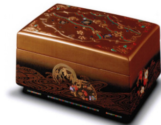
Maki-e jewelry box

Maki-e art is among the most exquisite Japanese traditional arts. Founded during the Nara era (8 th century), Maki-e is a painting technique that decorates wood or metal items, such as watches, pens, jewelry boxes, trays and bowls. Items are covered by several layers (from 7 to 60) made of powder, thin plates of gold, silver and shells, as well as lacquer. As each layer has to dry in the air, the whole process may take from 5