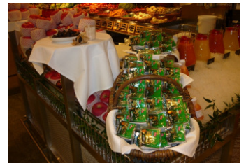
Japanese black garlics