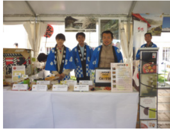
Japan booth at WTO Open Day

In his welcome speech, Pascal Lamy expressed the wish that the WTO Open Day would be an opportunity for discussions and exchanges. More than 3,000 people visited the WTO headquarters building. They had a chance to know more about international trade and WTO activities, to meet WTO staff and mem-