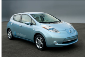
Nissan Leaf electric car

The car will then be manufactured in some other