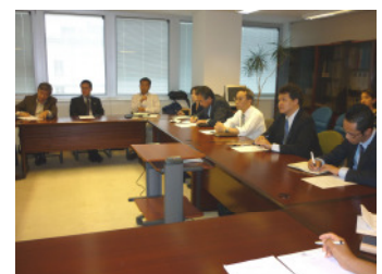
Participants attending the JETRO workshop on Swiss legal system