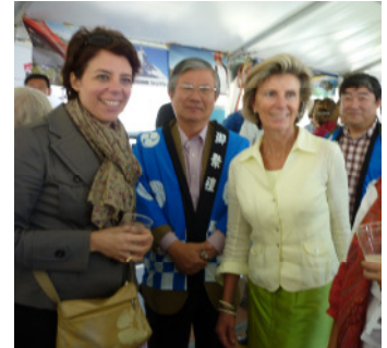
Some personalities visited the booth of Japan.

By the end of the day, more than 1,000 people visited the booth of Japan, including some local celebrities (see picture).