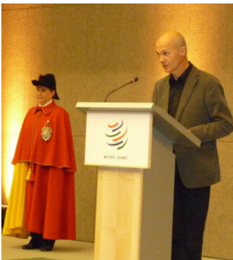
Welcome speech of Pascal Lamy, WTO Director-General