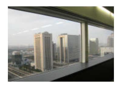
View of Makuhari Messe (Chiba Pref., close to Tokyo) from Snowflake office

Around 3,000 hybrid cars are annually sold in Switzerland. Insight is selling well in Switzerland: more than 600 units are already sold in two months. Insight is sold from CHF affordable 28,900, an price for a hybrid car. It consumes 4.4L / 100 km and emits 101 CO<sub>2</sub> g/km. Insight is designed rather for a "green" way of driving. If you push the "Econ" button, the car will automatically reduce the energy consumption of various functions, especially heating and cooling. Moreover, the Insight's speed meter light on futuristic dashboard changes from green, when your driving maximizes economy, to blue when it is wasteful. In the Insight, ecology and economy go with pleasure.