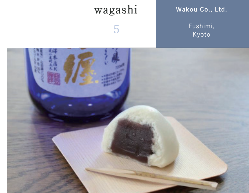
Class/Steamed cake Best before/360 days (frozen, for export)

Contrary to its simple appearance, you will be intoxicated by the complex and rich aroma of sake.