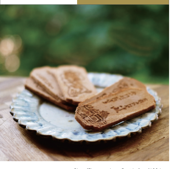
Class/Flour cracker Best before/180days

A long-selling "odori senbei" which has been sold for 100 years in Kyoto.