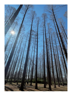
WINTER Sometimes it snows!