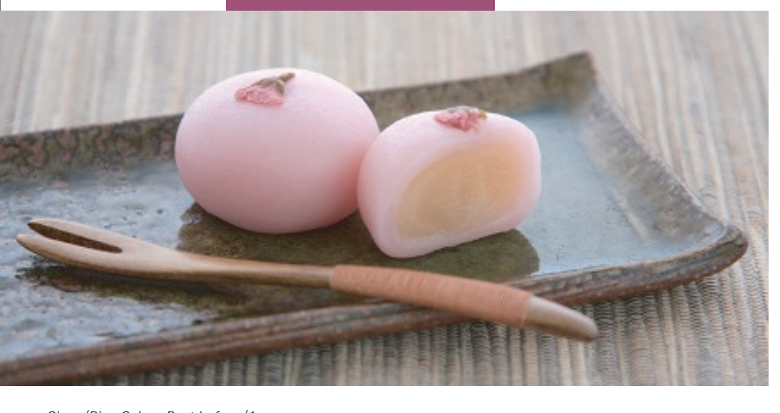
Class/Rice Cake Best before/1 year

Enjoy cherry blossom in your country and feel spring with hanadayori.