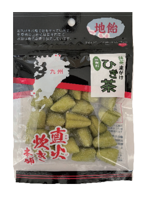
Class/Candy Best before/1 year