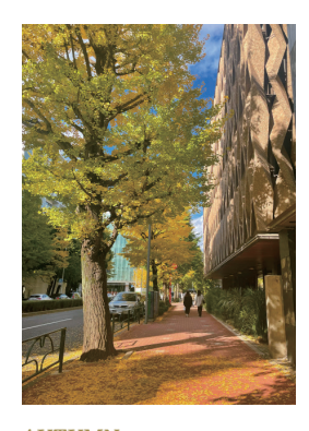
AUTUMN Gingko trees in Autumn