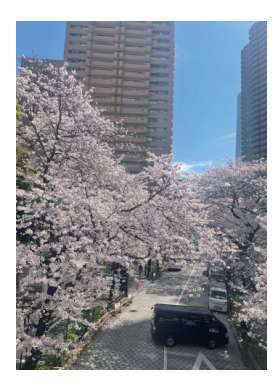
SPRING Cherry blossoms near Tokyo HQ

Here are "pictures that you can feel each season" taken by me in Tokyo, where our headquarters is located. I hope you will enjoy the beauty and transition of the "four seasons" through these photos. You will be able to better understand Japanese culture!