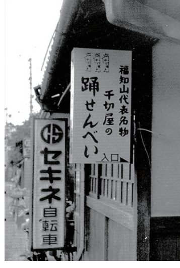
A photo taken at the time of the company's establishment.

Ingredients are carefully selected from the finest ingredients, such as eggs with less chemical fertilizers and the highest quality flour with less gluten. Because of their high quality, "odori senbei" have won the Prime Minister's Honorary President Award and awards at national confectionery competitions, and have been featured extensively on TV and in magazines.