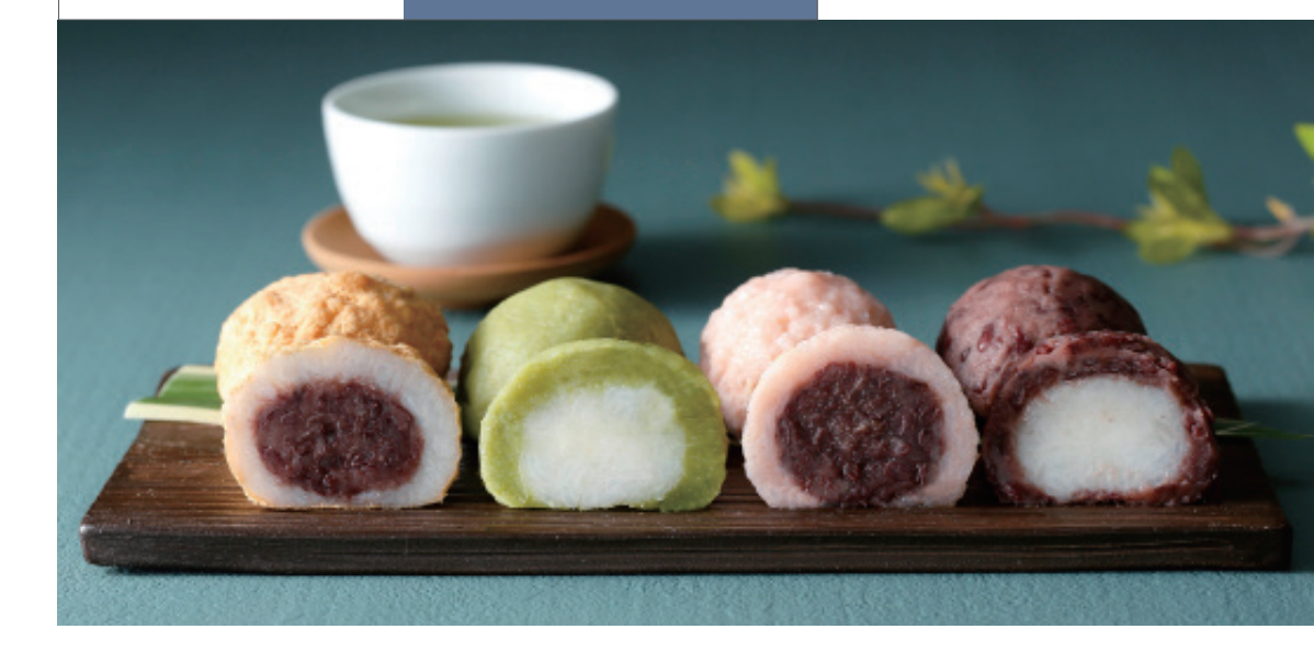
Class/Rice Cake Best before/6 months to 1 year