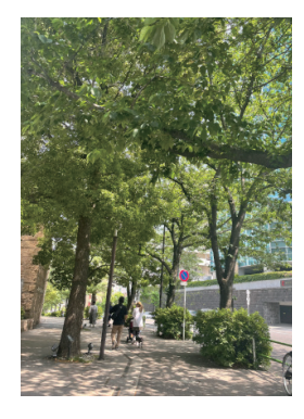
SUMMER My favorite Summer green!