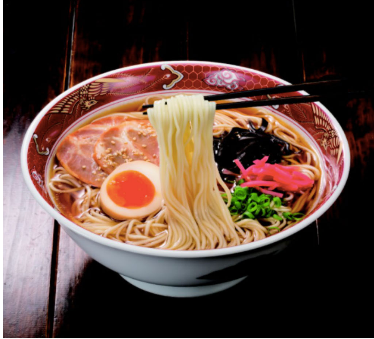
You can eat one of the most popular dishes in Japan for Gluten Free!