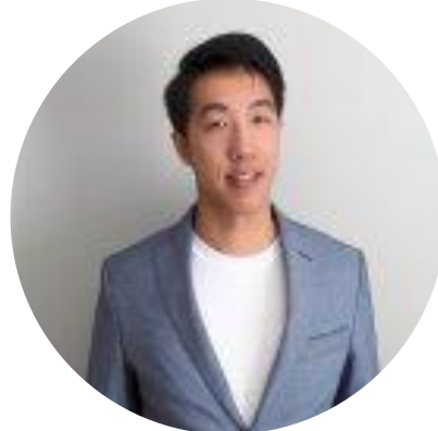
Fergus Chan Biotech