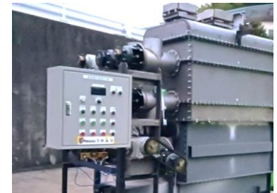
【Tromso 's biochar production equipment】

2025: Start of site survey and equipment manufacturing 2026: Equipment installation and start of biochar production 2028: Completion of the project and start of business operations