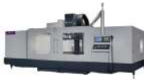
HARTFORD SUMO VMC 3100