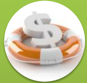
Financial Assistance (MDG & SEF)