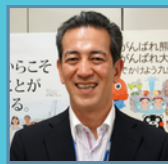
Kenichi Ogasawara Councillor for Overseas Projects, Ministry of Land, Infrastructure, Transport and Tourism (MLIT)