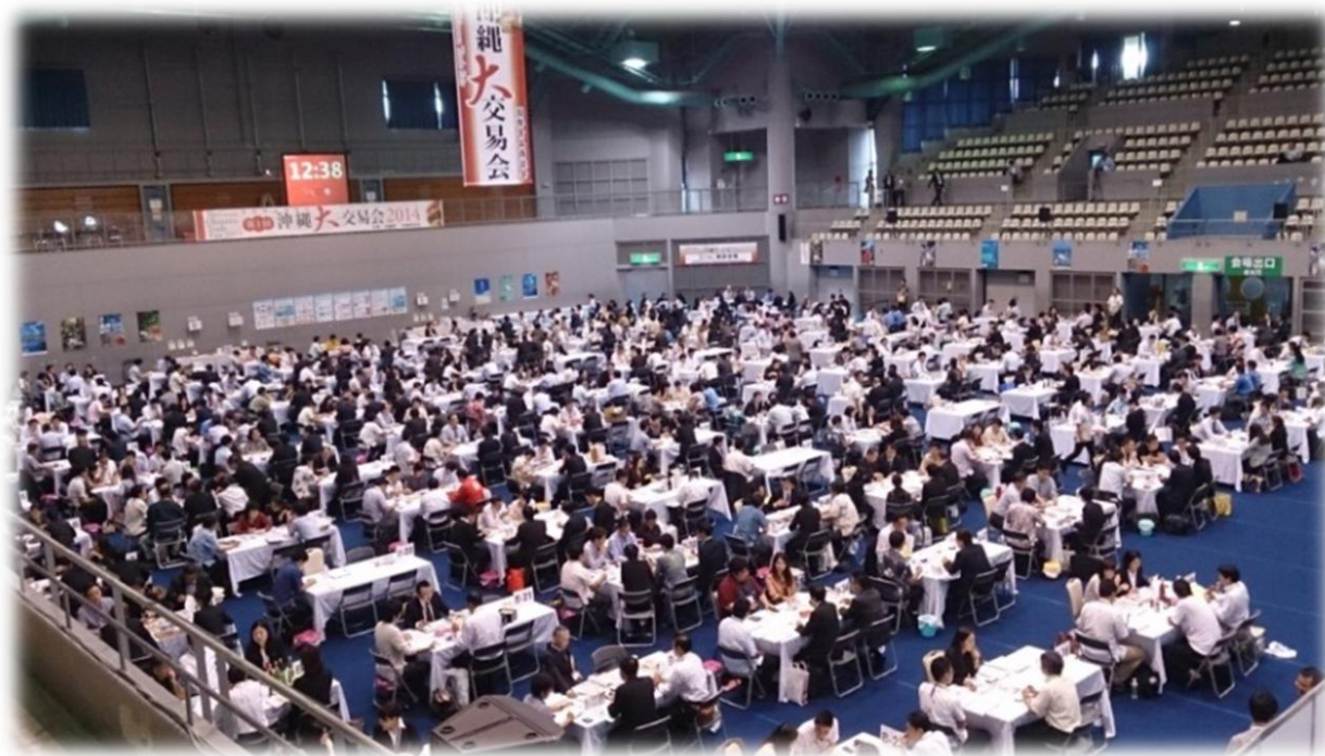
Business meetings at The Great Okinawa Trade Fair 2014

(JETRO Business Meetings will be held on the same floor concurrently with the Great Okinawa Trade Fair)