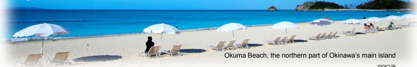
Okuma Beach, the northern part of Okinawa's main island

We hope you will attend to learn more about the attractive and delicious foods that Japan has to offer!