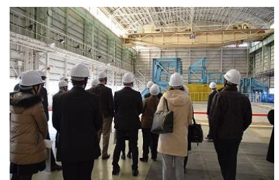
Touring research institutes (Feb. 2017)