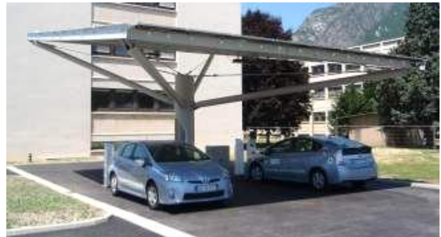
HELIOPHANE (CEA Grenoble)