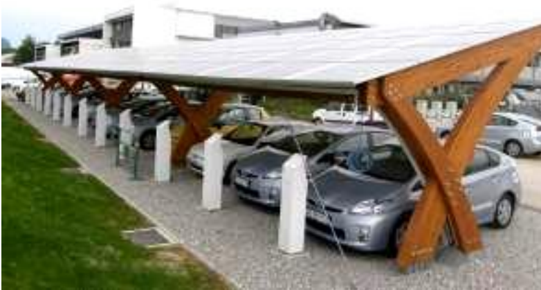
ILLIOPARK (INES Chambéry)