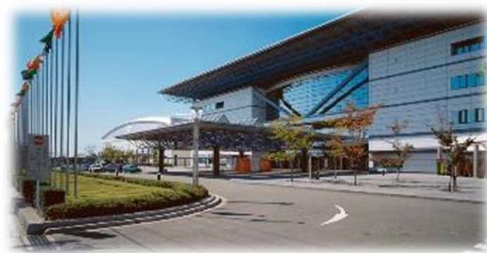
Venue: Nagoya International Exhibition Hall (Port Messe Nagoya)