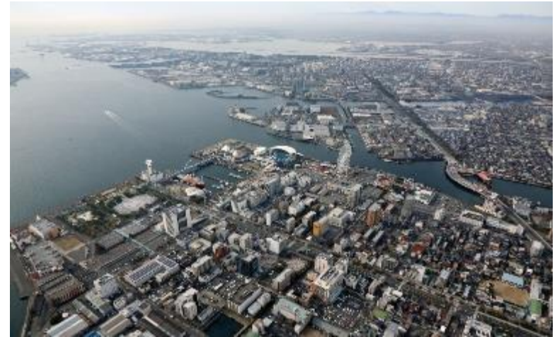
Port of Nagoya