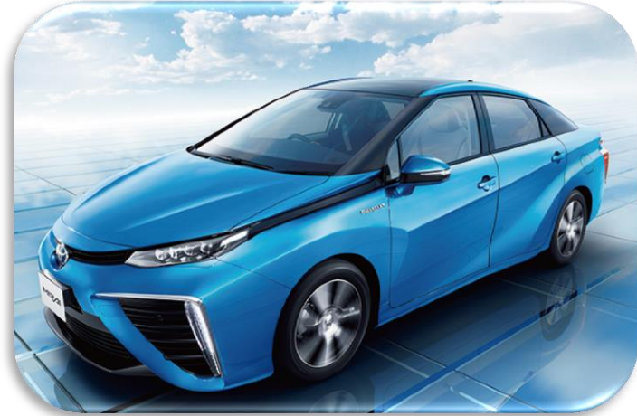
TOYOTA "MIRAI" (fuel cell vehicle)