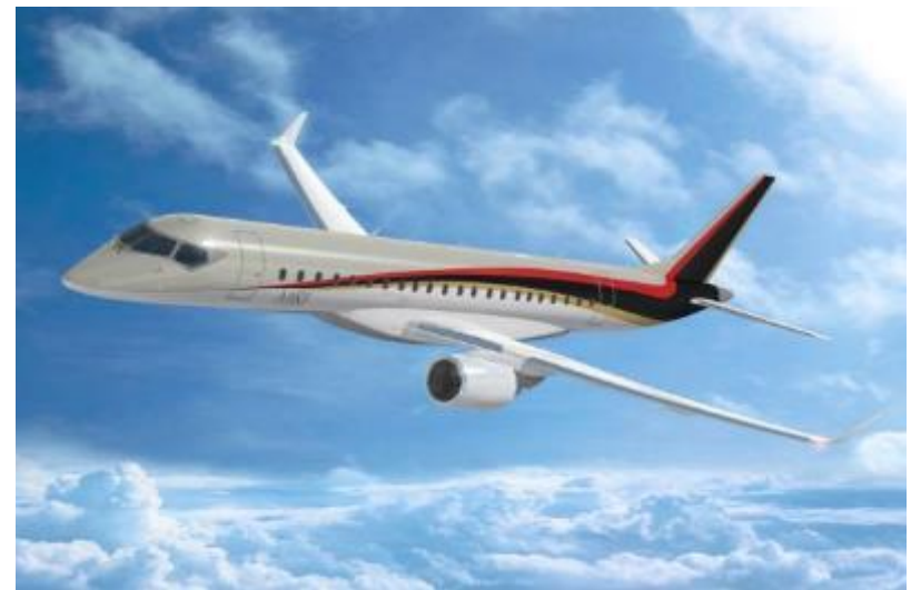
Mitsubishi Regional Jet