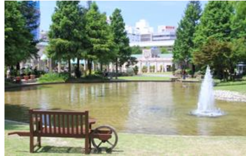
Hisaya-Odori Gardens Flarie