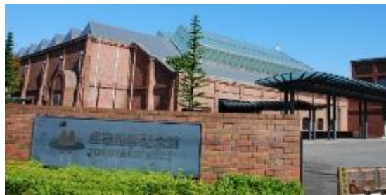
Toyota Commemorative Museum of Industry and Technology