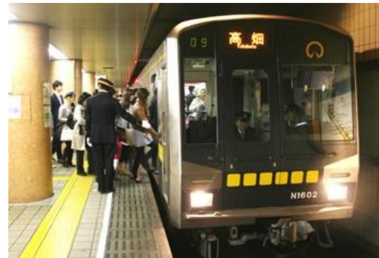
Subway in City of Nagoya