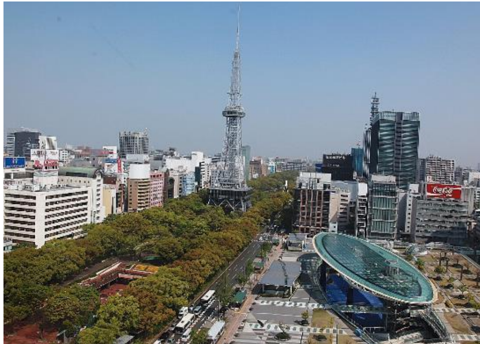
Sakae District, one of the major downtown districts in Nagoya