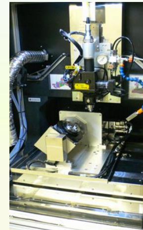
Desktop high precision 5-axis laser