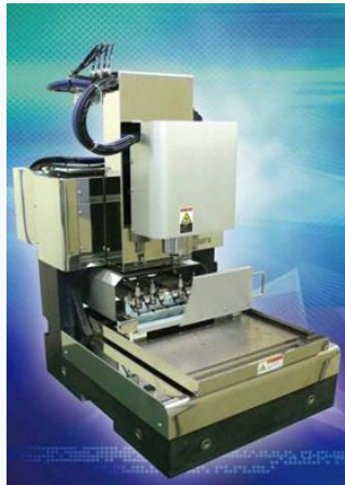
various machining head