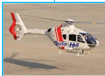
● EMS (Doctor-Heli) equipment