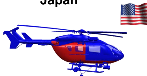
UH72 EC Assembly line USA