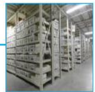
Tokyo, Shinsuna Logistics Center