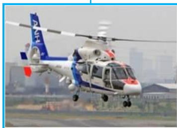
● Broadcast system installation