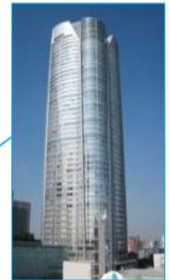
Tokyo, Roppongi HQ