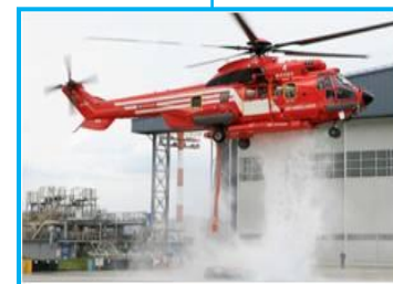
● Fire attack, tank and bucket