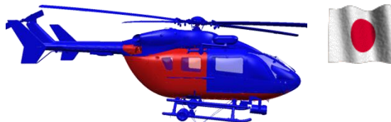
BK117 C2 KHI Assembly line Japan