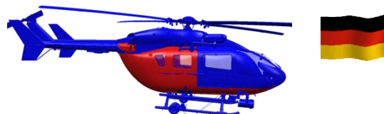
EC145 EC Assembly line Germany