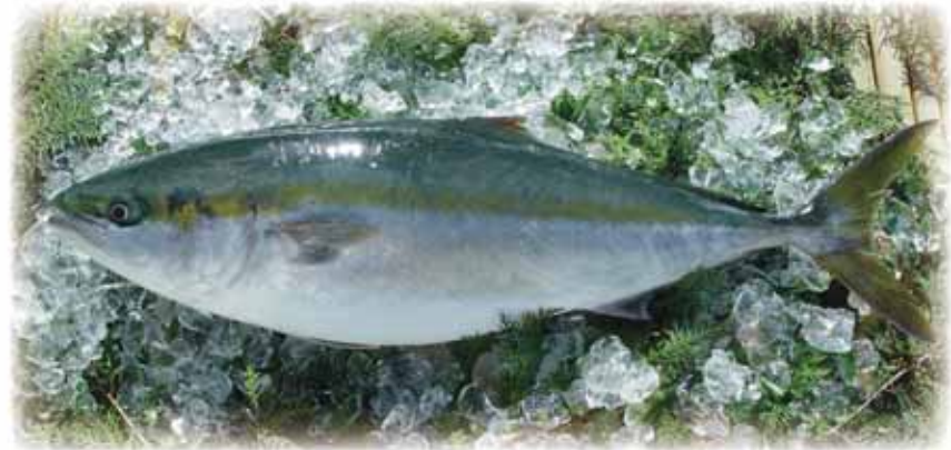
• Fresh HAMACHI H&G (Dressed)

Raised in the largest available net cage in Japan. Pristine taste and high fat content. Gutted and Headed at HACCP factory.