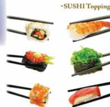
• SUSHI Topping

We can maintain this high quality product all year long.