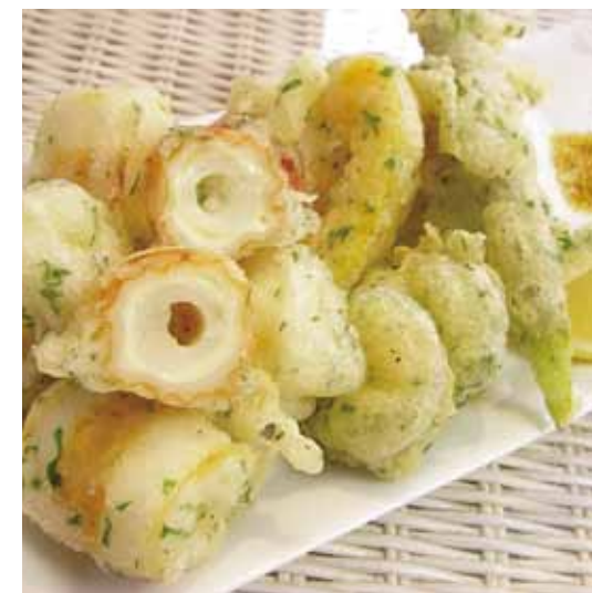
烤竹轮 该产品是本公司龙头产品之一。鱼肉含量高，适合做油炸天妇罗，火锅配料等。 CHIKUWA (Boiled Fish Paste) The product is one of the company's leading products. Fish percentage is high, suitable for fried tempura, hot pot ingredients.

JAPAN Address 1-10 Tezandoori, Shiokama-shi, Miyagi, JAPAN Tel / Fax +81-767-53-8361