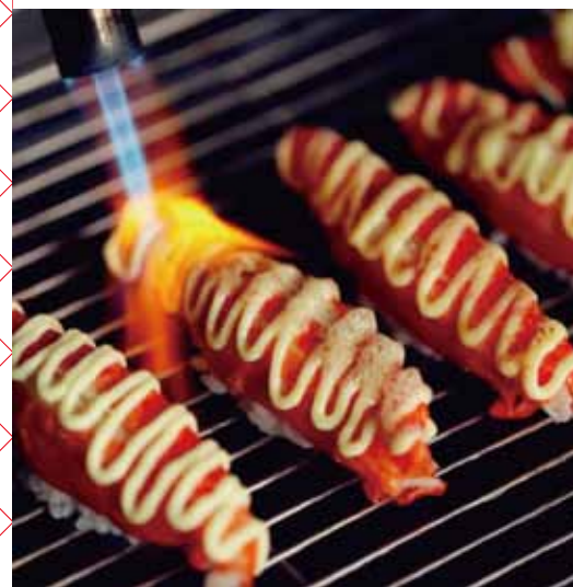
皇室加勒比（蟹柳） 本公司具有专利的叶脉状生产技术及采用高等鳕鱼鱼浆，西红柿，辣椒红等天然色素制成。本产品适合寿司（需要特制调味料），火锅料的菜肴。适应当代消费者的《安全/安心/健康》的饮食要求。 Royal Carib (Imitation Crab Meat) This product, by using our own vein-like manufacturing technology, the minced fish of offshore processing was high quality Walleye Pollack as a main raw material, use lycopene, a natural dye, such as capsanthin. Use this item to cuisine such as sushi and pot. This product is safe, peace of mind, is a healthy product.