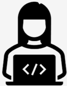
[Example] Engineer (33-yrs old)