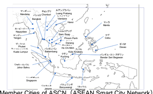
Member Cities of ASCN (ASEAN Smart City Network)