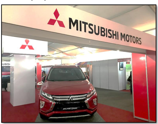
Japanese top brands are here