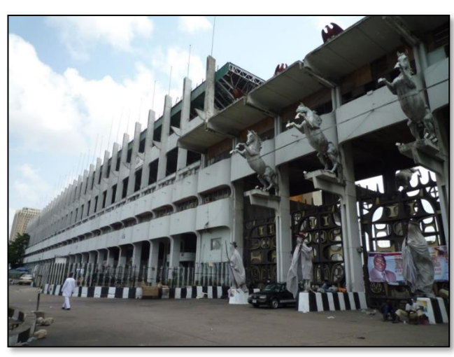
Tafawa Balewa Square is a historic place in Lagos. Nigeria's independence ceremony was held here