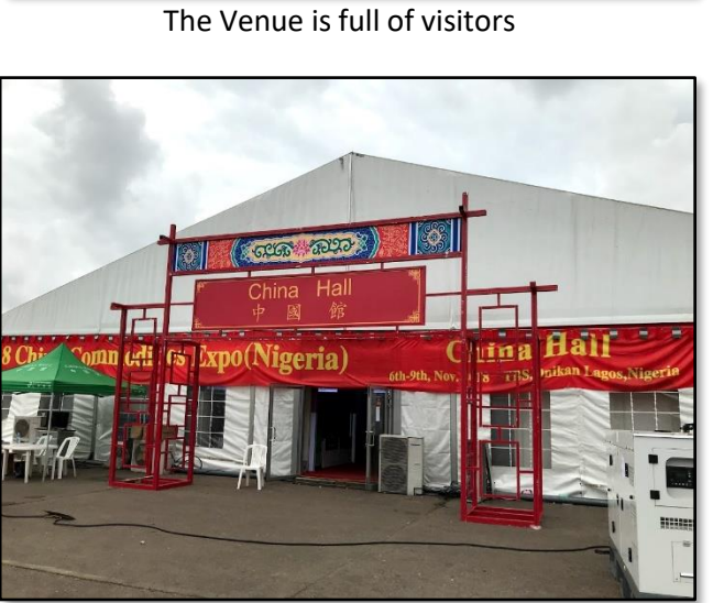
China pavilion is also one of the biggest