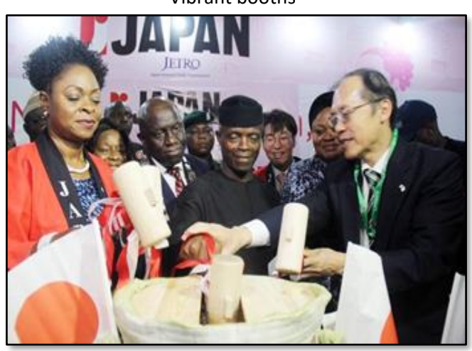
Many VIP visit the pavilion Vice President of Nigeria has visited the pavilion last year