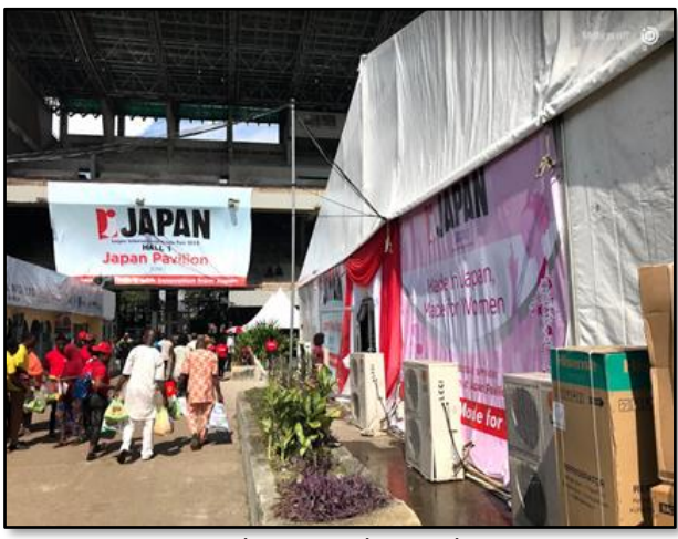
Japan pavilion stands out the most