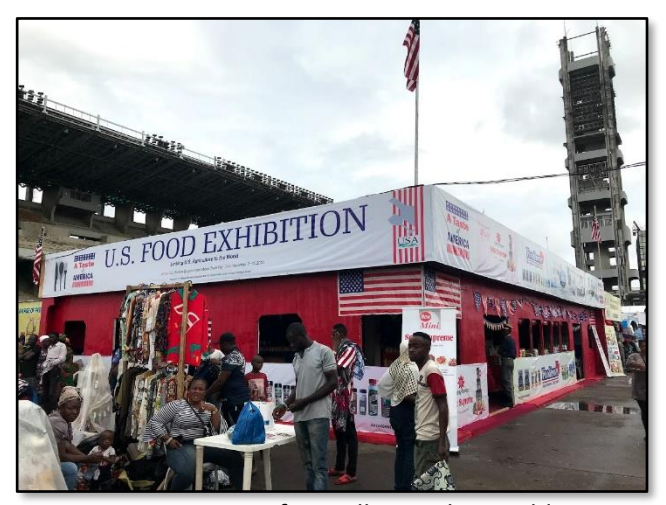
Participation from all over the world