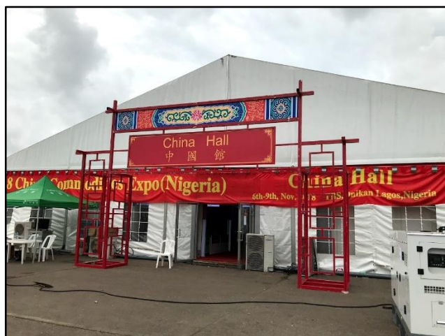
China pavilion is also one of the biggest