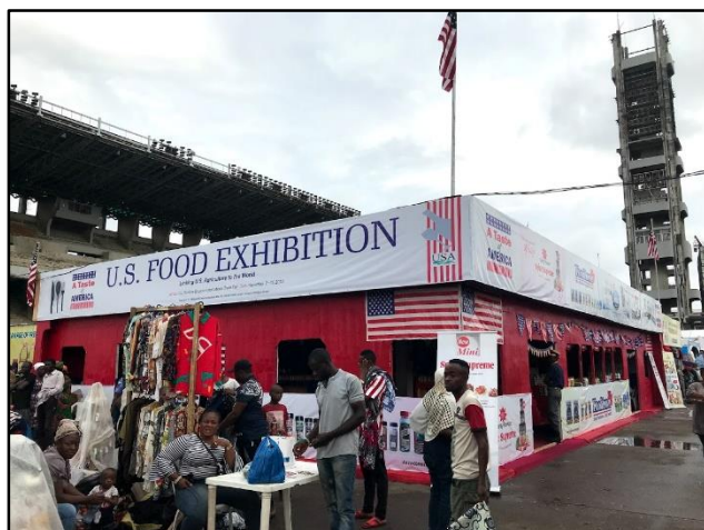
Participation from all over the world