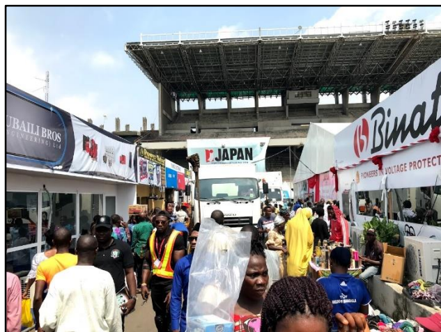
The Venue is full of visitors