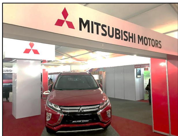
Japanese top brands are here