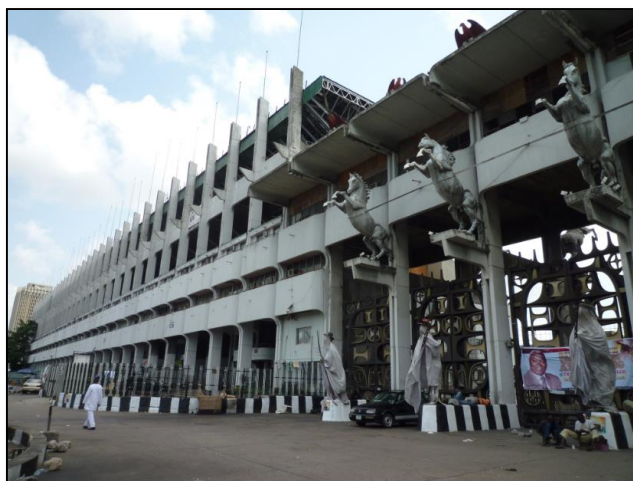
Tafawa Balewa Square is a historic place in Lagos. Nigeria's independence ceremony was held here