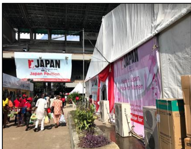
Japan pavilion stands out the most