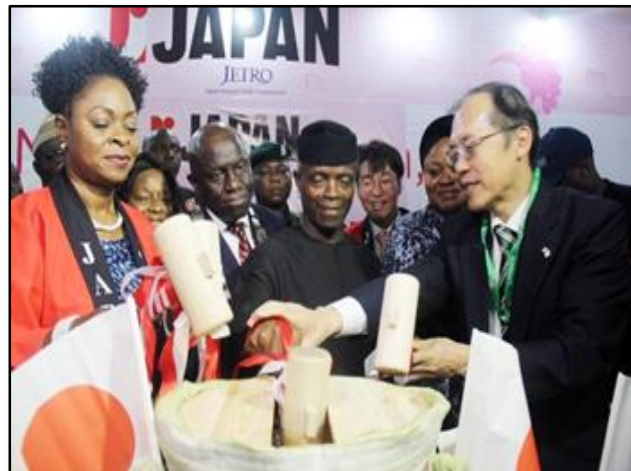
Many VIP visit the pavilion Vice President of Nigeria has visited the pavilion last year