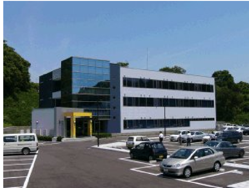
Head Office (Iizuka city)