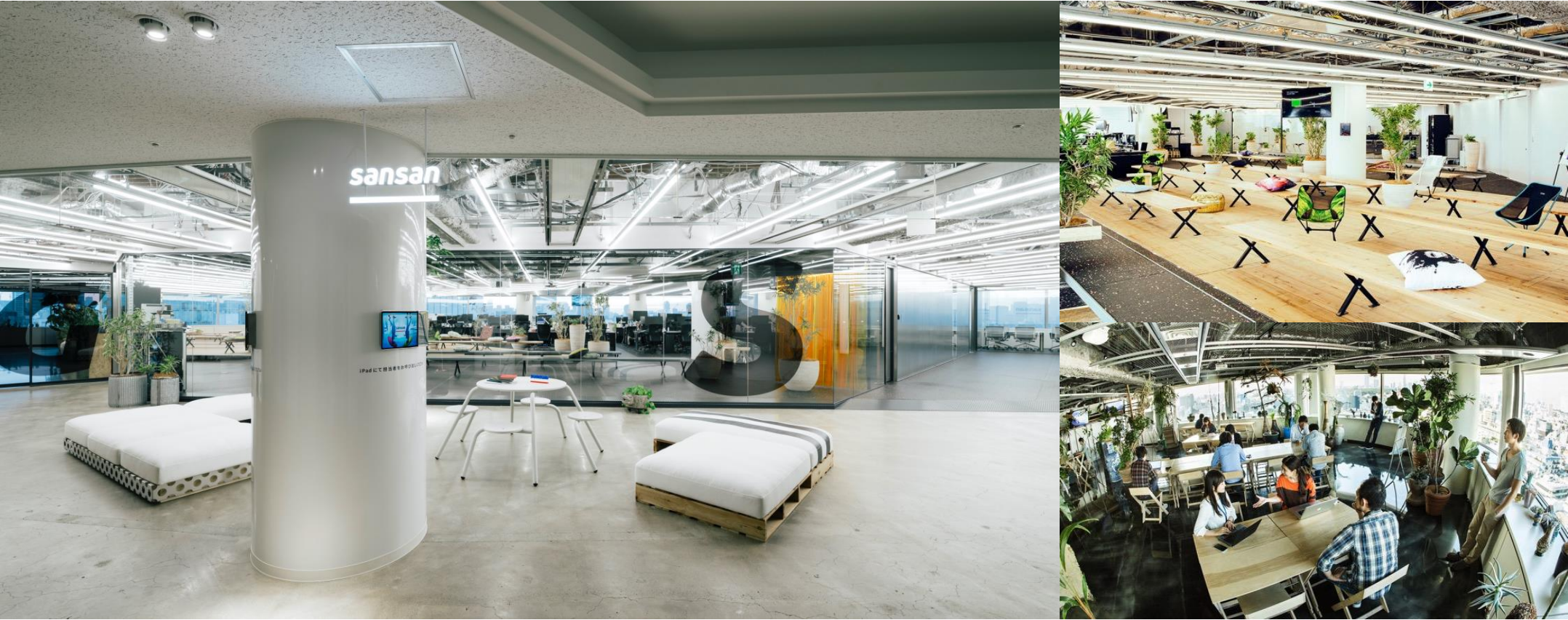
Office Tour (Japanese) https://jp.corp-sansan.com/mimi/2020/04/office-tour.html