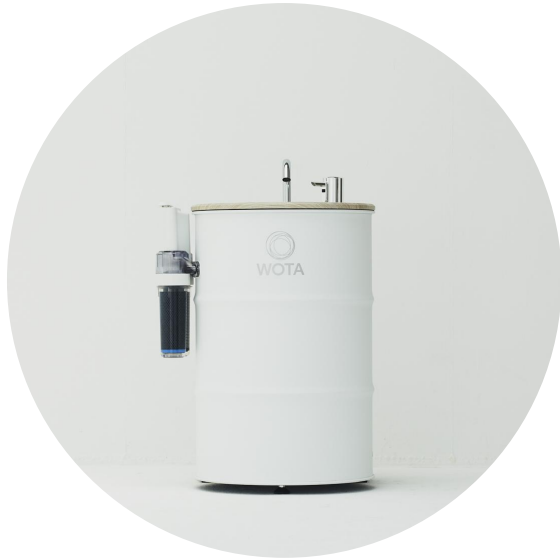
Portable Hand-Washing Stand WOSH

Hand-washing with running water without access to plumbing and smartphone sanitizer are the new hand hygiene standard.