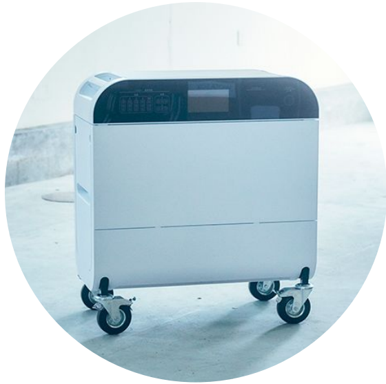
Portable Water Recycling Plant WOTA BOX