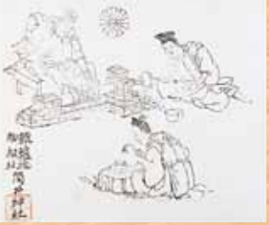
Woodturning by hand from the 8th century to the 19th century

During the Edo period, in addition to basic woodwork techniques, high-level techniques for woodturning and lacquer were aggressively adopted. From 1648 to 1818, many skilled artisans were recruited from Kyoto and other places all over the country. They developed advanced techniques such as "shu-tamenuri" (vermilion urushi) and "koma-nuri" (multicolored layer decoration), refining techniques to establish the features of today's Yamanaka Lacquerware. Over the course of time, splendid lacquerware items such as bowls, plates, trays, and tea ceremony implements with glamorous gold powder/lacquer decoration were produced by means of delicate woodturning techniques.