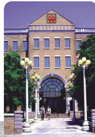
Corporate Headquarters Mississauga, Canada

Chemical research and development, product and process engineering, tooling, manufacturing, technical support, accredited laboratory testing, assembly and sequencing and just-in-time delivery