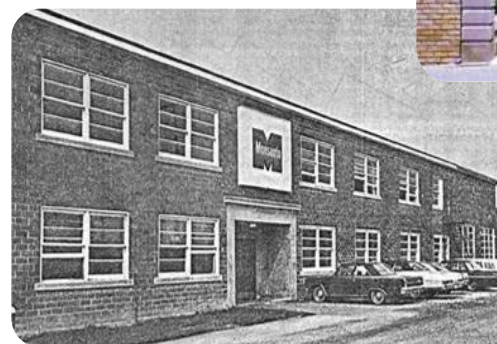
Kipling Avenue Plant Woodbridge, Canada circa 1969