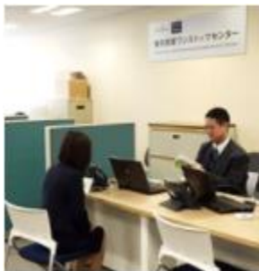
Tokyo One-Stop Business Establishment Center @ JETRO Tokyo IBSC