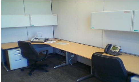
Private office space