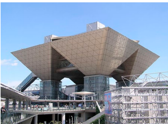
Tokyo Big Sight