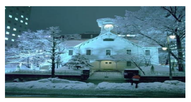
Sapporo Central Wholesale Market(*)Sapporo Clock Tower(*)http://www.sapporo-market.gr.jp/english/index.htm