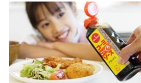
Sauce for Fried Pork