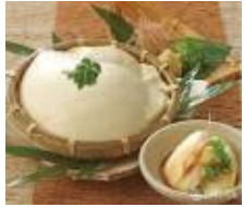
Tofu (soybean curd)