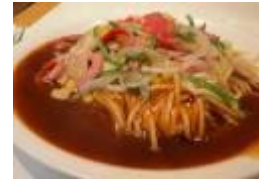
Starchy sauce for pasta