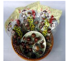
Smoked Quail Eggs