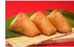
INARI-Fried bean curd flavored with soy sauce & sugar