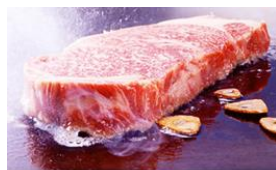
Gifu : HIDA Beef