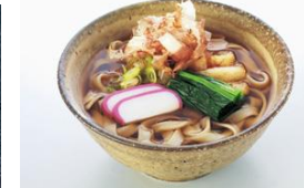
Aichi: Kishimen (Flat Noodle)