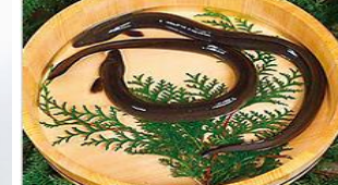
Shizuoka : eels

Since Gifu Prefecture and Mie Prefecture are in the same economic block as the Aichi Prefecture, many companies from these prefectures are also expected to join the upcoming business meetings.