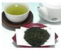
Green tea (Sencha)