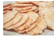
Japanese rice cracker