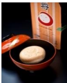
Instant miso soup