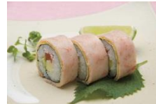
Shrimp Sheet for Sushi Rolls