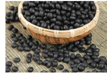
Black bean tea