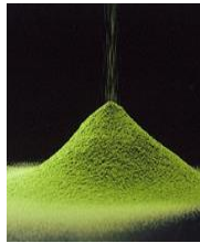
Green tea (Matcha)