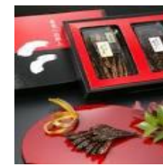
Fish boiled in soy sauce