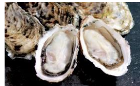
Mie : Oyster