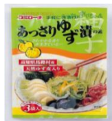
Seasoning-powder for Japanese pickles