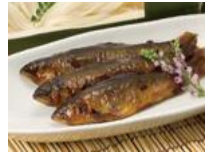
Sweet fish stewed in soy sauce and sugar