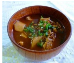
Haccho Miso (Soybean paste)