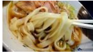
Dried Noodle (Kishimen)