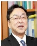
Atsushi Ohtsu National Cancer Center Hospital East