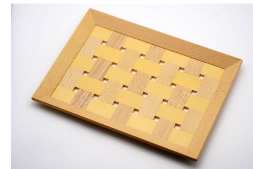
Kumiko bon tray Retail price in Japan : ¥ 22200 (Excluding tax)