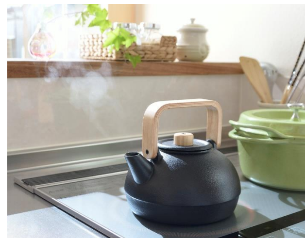
HS-314S/Iron Tea kettle/S

Retail price in Japan : ¥30,000 (Excluding tax)