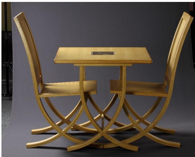
Hello Little Girl & Lady Madonna 1set Retail price in Japan : ¥ 254000 (Excluding tax)