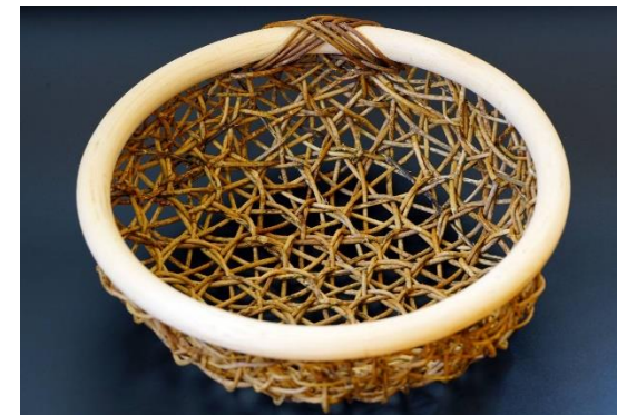
Akebi Chocolate Vine Irregular woven Multi-Purpose Round Basket 30 x 30 x 10 cm Retail price in Japan: 23,000 yen (Excluding tax)