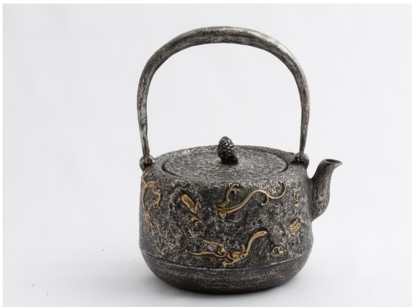
Dragon in Rain Retail price in Japan: 470,000 yen (Excluding tax)

http://www.araioubou.com/araioubouhomeindex.html