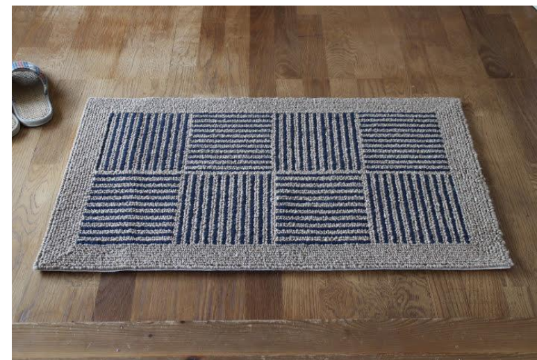
Honami rug Ichimatsu 60cm×100cm Retail price in Japan : ¥ 23,000 (Excluding tax)