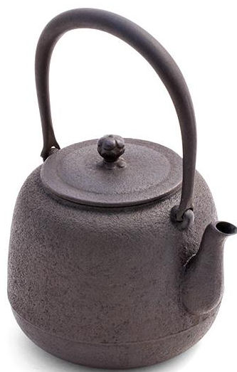
Tetsubin Iron Teapot Natsume Volume: 1.5 L Retail price in Japan: 65,000 yen (Excluding tax)