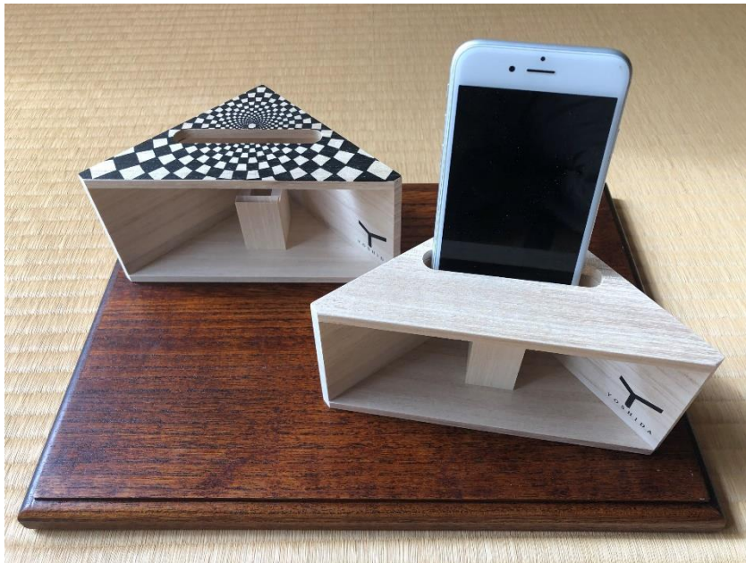
Smartphone Speaker Amplifier "KIRINONE" Retail price in Japan : ¥ 3,150 (Excluding tax) Size : 12 x 12 x 8 (cm)