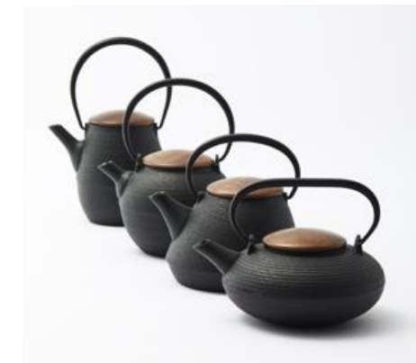
Combination of iron teapot and wooden lid

Retail price in Japan:¥6,500 (Excluding tax)