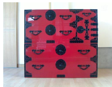
Yonezawa style Red-lacquered Double-decker chest

We make Yonezawa chest of drawers of historic traditional crafts by paying attention to the material and the method of making.