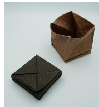
Accessory case (coin purse) Retail price in Japan : ¥ 1,000 (Excluding tax)

Gassan Washi is made at Nishikawa town in Yamagata, located at the foot of Gassan mountain (famous for summer skiing). The washi inherits its traditional manufacturing methods from ancient times, and is made by hand from the stage of raw material processing to completion. Thus, each piece is different. While protecting the tradition, Kamiya Sakuzaemon makes washi paper and washi-paper accessories matching modern lifestyle.