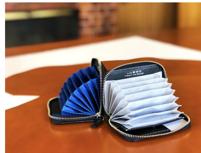
Yamagata Cattle bellows card case Retail price in Japan: 10,909 yen (Excluding tax)