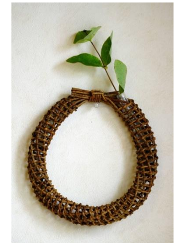
Akebi Chocolate Vine Wreath * Also serves as a single flower vase 25 x 25 x 1.3 cm Retail price in Japan: 5,000 yen (Excluding tax)