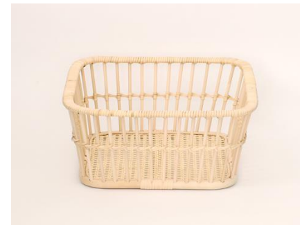
[Square-180] 400mm x 400mm x h180mm ¥ 12,800 (Excluding tax)

"The more the product is used, the more it gains the patina that makes its distinctive character". Elderly people should have nostalgia for rattan products "Goods made by Japanese craft men." However the flux of time has made rattan products into South Asian goods. Since our foundation in the late Meiji era, we have been stubbornly sticking to "domestic production of our own manufacturing", and have kept the human touch in the changing times. We hope you understand the advantages of domestic rattan products made by delicate Japanese handicrafts. In line with the recent popularity of symbiosis with nature, we will continue to present "certain products" going forward while using the natural material "rattan" and listening to the voice of the time.