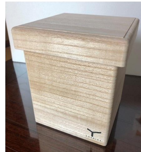
Bread Box Retail price in Japan : ¥ 3,000 (Excluding tax) Size : 17×17×18(cm)