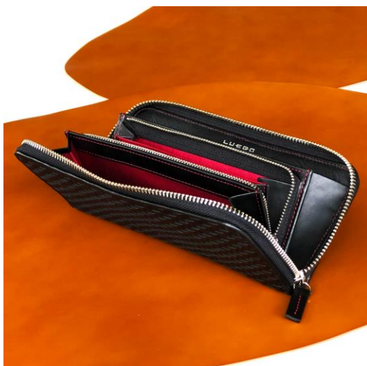
Yamagata Cattle jip round wallet Retail price in Japan: 31,818 yen (Excluding tax)