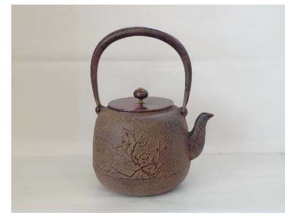
Tetsubin Iron Teapot Natsume Ume Lid: copper Volume: 1.5 L Retail price in Japan: 108,000 yen (Excluding tax)