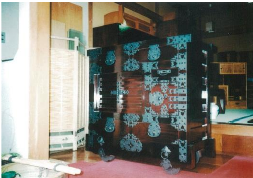
Yonezawa style Large chest of many drawers with wheels