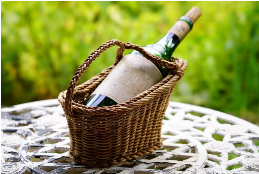
Akebi Chocolate Vine Wine Rack with handle 26x14x18cm Retail price in Japan: 20,000 yen (Excluding tax)