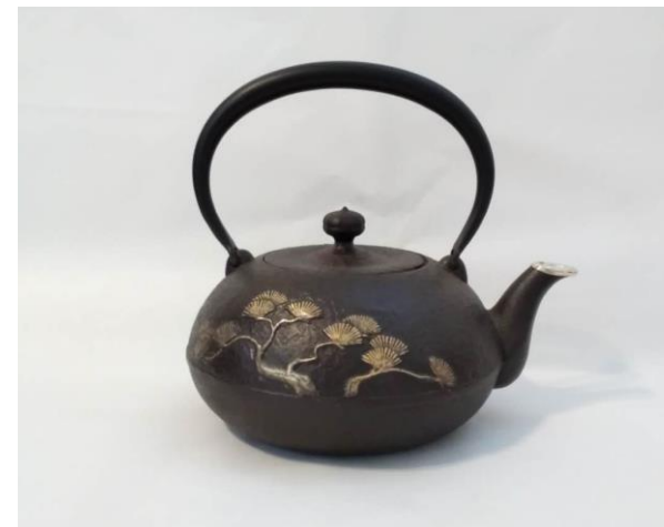
Tetsubin Iron Teapot: silver spout, gold leaf decoration of a pine tree on the body Retail price in Japan: 38,000 yen (Excluding tax)