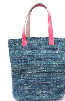
Hand-Woven Tote Bag

※All items vary as materials are all hand-woven