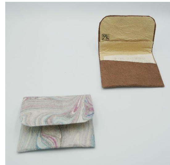
Accessory case (coin purse) Retail price in Japan : ¥ 1,000 (Excluding tax)