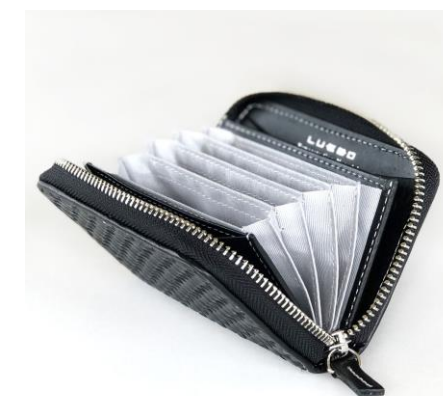
Yamagata Cattle card case wallet Retail price in Japan: 19,800 yen (Excluding tax)