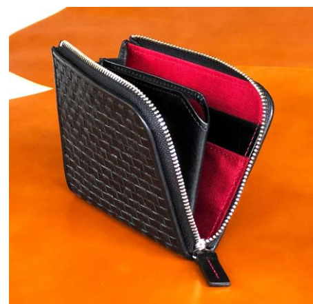
Yamagata Cattle zip wallet Retail price in Japan: 12,272 yen (Excluding tax)

Leather wallets and other items made from leather sourced from "Yamagata beef cattle" raised locally in Yamagata Prefecture. Because they are beef cattle and contain more fat than other cattle, we increased the number of times we conduct the tanning process, and cut the leather into much smaller pieces, both of which enabled us to use all parts without discarding parts with uneven colors or damages. Our leather wallets with the significance that comes only from handcrafting are hand knitted with thinly cut leather sourced from Japanese Black "Yamagata beef cattle" raised in Yamagata Prefecture. The delicately knitted stitches bring out beautiful shades that change when viewed from different angles.