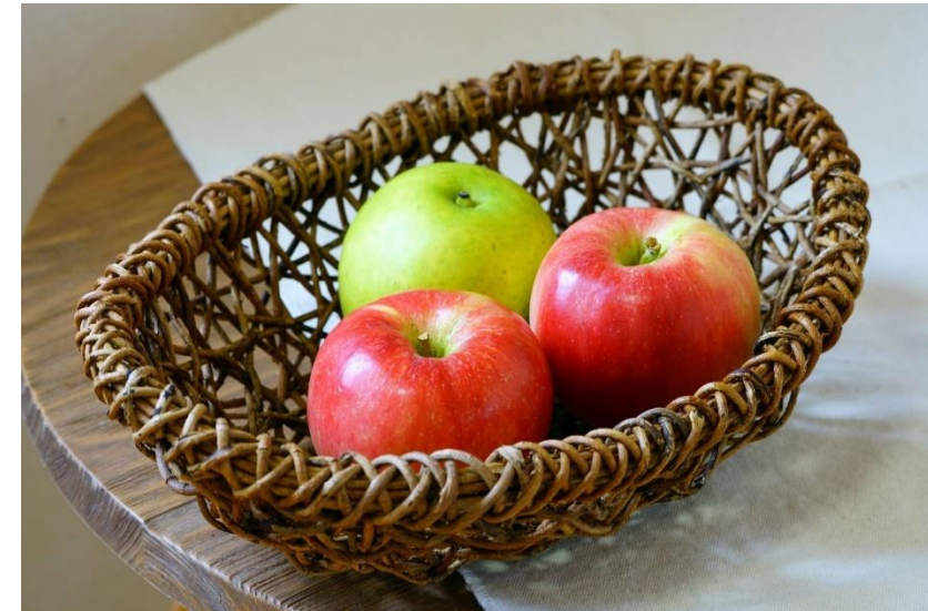
Akebi Chocolate Vine Irregular woven Fruit basket 33 x 24 x 12 cm Retail price in Japan: 20,000 yen (Excluding tax)

We utilize materials and techniques to create baskets that will be loved for a long time.