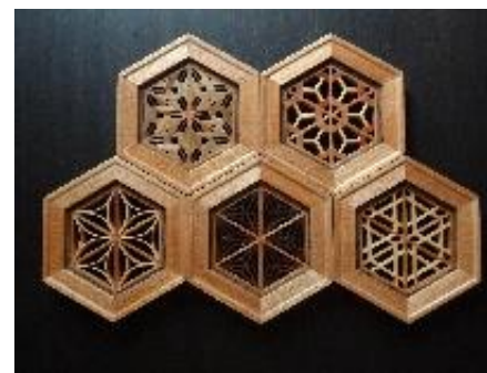
Zao Kumiko symbol Coaster 1set Retail price in Japan : ¥ 30000 (Excluding tax)

Under the concept of "traditional Japanese culture of joy and comfort, technical tradition in monozukuri (production)" that can be shared with our customers, we strive for a business that builds a relationship with customers in and outside Japan, helps improve the economy and creates a peaceful society and opportunities for cultural exchange. Our products include tables, chairs and other KUMIKO Furniture® built with the kumiko technique, light fixtures designed based on a First-Class Architect's idea, and small kumiko articles made with traditional furniture making techniques