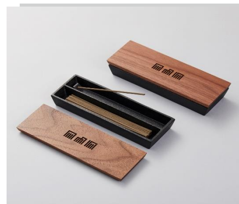
HS-72L/Awase incense box/Genjikou/L

We are producing cast iron kettles, teapots, pot stands, chopstick rests, paper weights and so on. Yamagata casting has a long history of 950 years. Yamagata casting continues up to today and is based on everyday commodity and art. It has a winning distinction with a solid reputation of traditional thin casting technique and the beauty of the surface called "Thin Beauty". We believe that our mission is to design modern lifestyle tools using the traditional technique of sandy skin and connect Yamagata castings to the next era. And these techniques have the advantage of not affecting the environment.