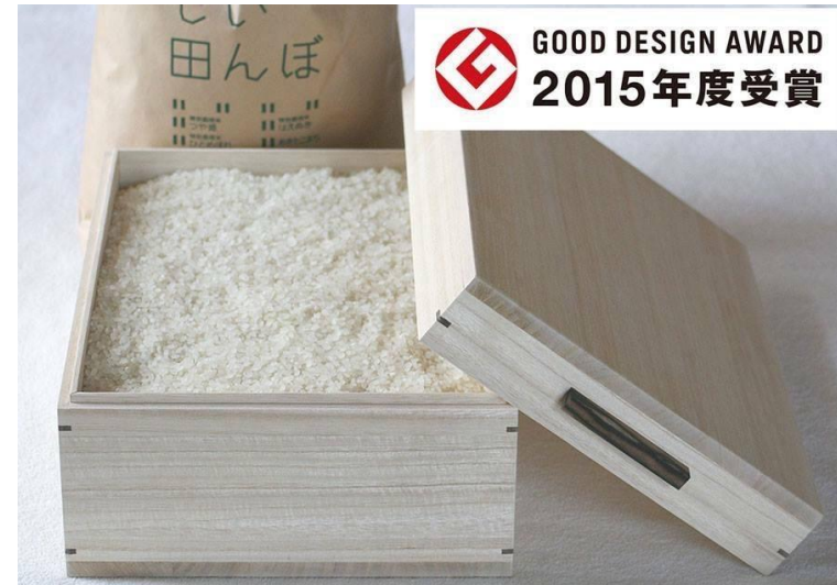
Paulownia Rice Chest (5 kg/10 kg) Retail price in Japan : 5kg ¥9,000 / 10kg ¥16,000 (Excluding tax) Size : 5kg 33×24×15 (cm) / 10kg 33×24×24(cm)