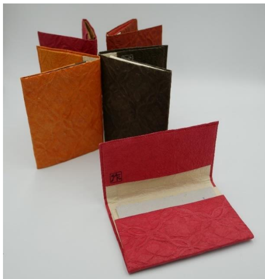
Business card holder Retail price in Japan : ¥ 4,000 (Excluding tax)

https://www.instagram.com/kmy_sakuzen/?hl=ja