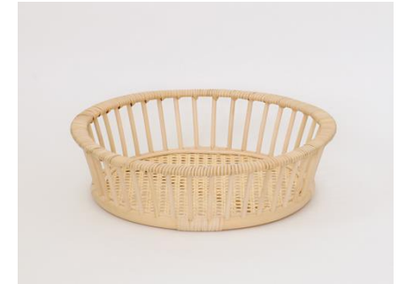
[Round-100] Φ400mm x h100mm ¥ 10,000 (Excluding tax)