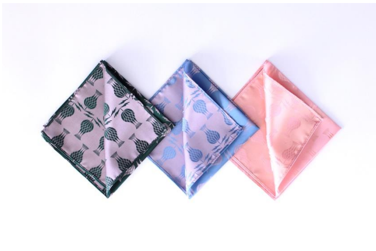
Safflower Pocket Square

Retail price in Japan: 2,500 yen/1 pc (Excluding tax)