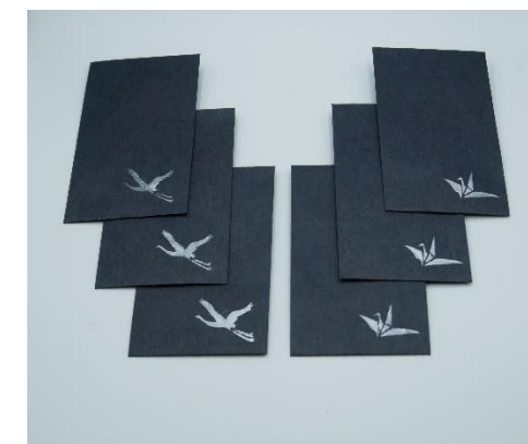
3 Envelopes for small gift Retail price in Japan : ¥ 500 (Excluding tax)