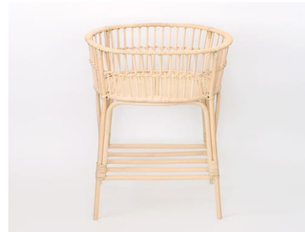
[Oval-600] 500mm x 400mm x h600mm ¥ 25,500 (Excluding tax)