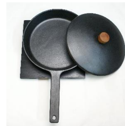
Cast Iron Frying Pan: 21 cm Retail price in Japan: 14,500 yen (Excluding tax)