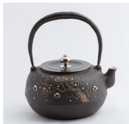
Tetsubin Iron Teapot: silver spout, silver inlay on the body Retail price in Japan: 300,000 yen (Excluding tax)

Tetsubin iron teapot. We produce each item with care and decorate them with gold leaves, silver inlay, etc. They are finished with particular care for cooking pots, frying pans, and Urushi lacquer coating.