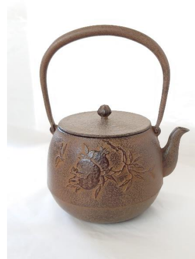
Tetsubin Iron Teapot Zakuro Volume: 1.8 L Retail price in Japan: 90,000 yen (Excluding tax)

Our main product is tetsubin iron teapots. We continue the traditional techniques focused on casting, and strive to produce "high-quality tetsubin iron teapots that are loved for a long time" with care. A new mold is created for each teapot, and the same mold will not be used twice. This creates a thin, light tetsubin with a beautifully patterned surface (product surface). Coloring is also done in a traditional technique of Urushi lacquer printing. This adds a unique taste of Urushi lacquer to the teapots, and, unlike painted tetsubin, increases the luster with use. Tetsubin, made intentionally using traditional techniques that require time and effort, is not simply an object but a tool that is "easy to use and loved for a long time," and grows together with the owner.