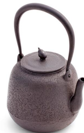
Tetsubin Iron Teapot Natsume (Small) Volume: 1.0 L Retail price in Japan: 60,000 yen (Excluding tax)