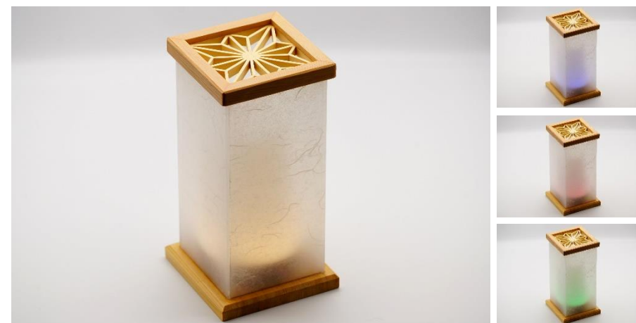
Kumiko Candle lighting Retail price in Japan : ¥ 20700 (Excluding tax)