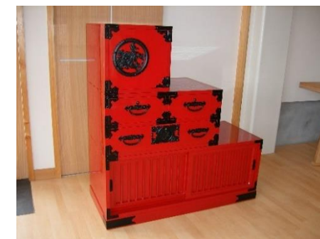
Yonezawa style Red-lacquered Staircase chest