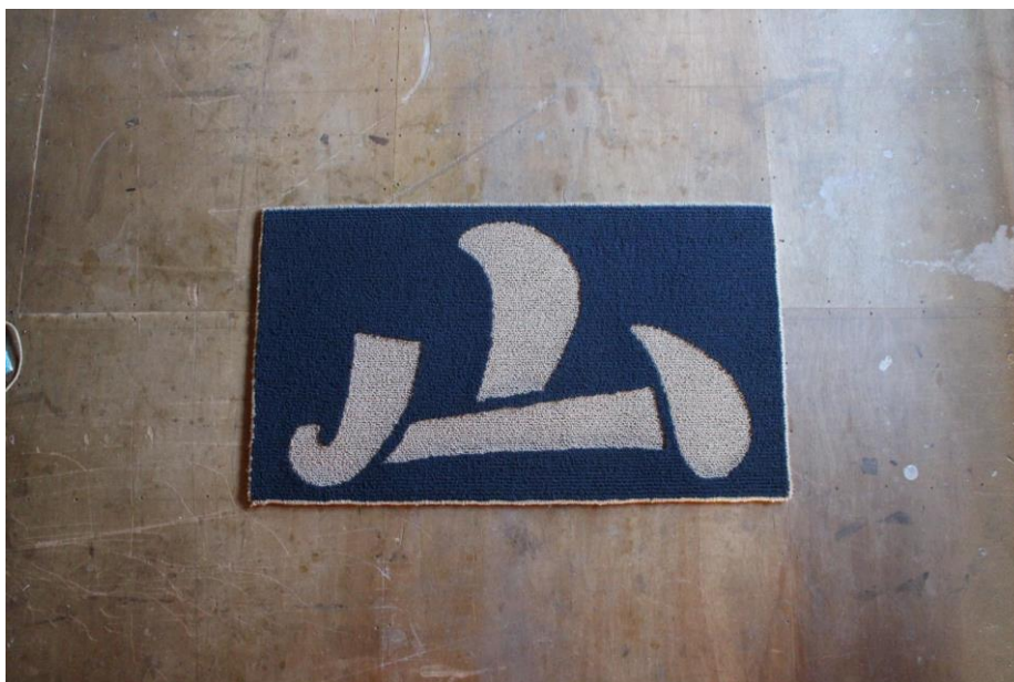
Yama rug/Mountain rug 40cm×70cm Retail price in Japan:¥11,000(Excluding tax)