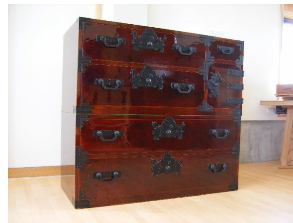
Yonezawa style Urushi-Lacquered Double-decker chest

Retail price in Japan : ¥ 770000 (Excluding tax)