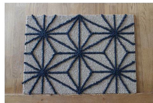
Asanoha rug 50cm×70cm Retail price in Japan : ¥ 30,000 (Excluding tax)

Rugs, Carpets, Hand tufted rug Hozumi Textile in Nakayamamachi, Yamagata, produces rugs that are natural and unassuming like the air but also delightful. The colors of their natural materials blend into anyone's lifestyles. The company strives to create rugs that bring happy feelings to as many people as possible. It also plans to hold various workshops to pass on to people the carpet culture nurtured in Japan.