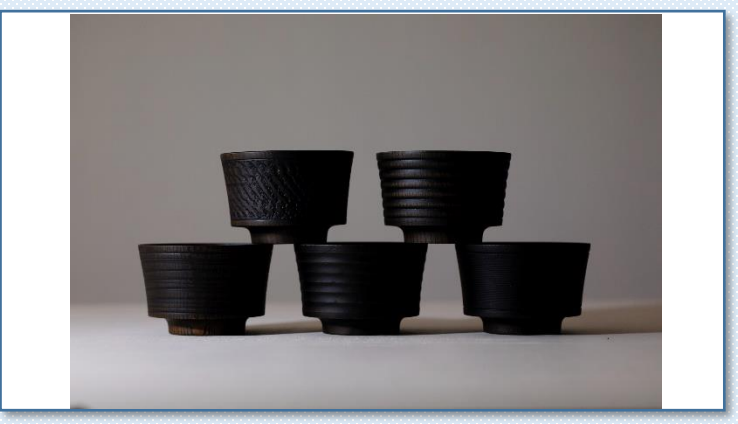
Kashoku Decorated Bowl

Detail: "Shinafu" in an archaic word, meaning "elegantly hanging." The shapes of SINAFU's bowls and dishes were designed to reflect the traditional shapes and spirit of hospitality of Yamanaka Hot Spring, which has been welcoming visitors and passing on the techniques of wood turning since the time that Nara was the capital of Japan in the 700s. SINAFU does not only express warm hospitality with beautiful arrangements on bowls and dishes, but also literally makes your hands movements look more graceful.