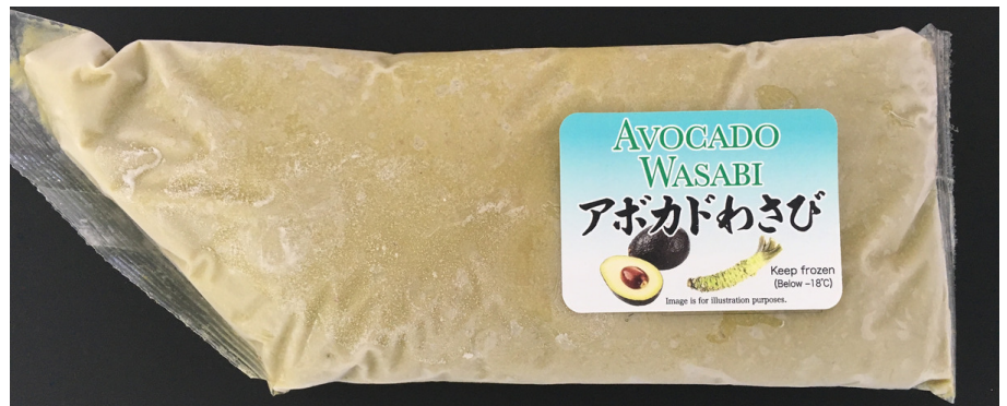
Avocado Wasabi アボカドわさび