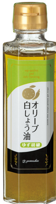
Olive oil + white soy sauce, with yuzu pepper オリーブ白しょう油ゆず胡椒