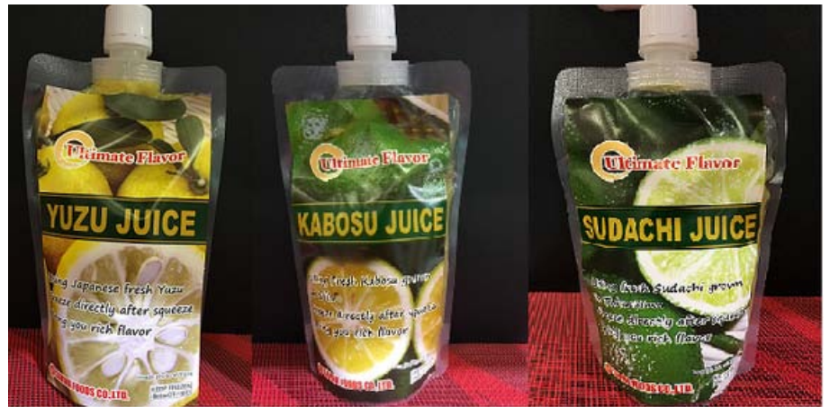
Yuzu, Kabosu, Sudachi Seasoning 冷凍ゆず果汁・かぼす果汁・すだち果汁